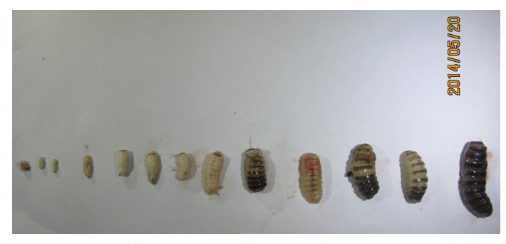
Figure 1: Different inster of O. ovis larvae retrieved from the Para nasal sinus through necropsy

The goat was necropsies thoroughly immediately after death and macroscopic observations, including in the nasal, paranasal sinuses and cranial cavities were recorded. A sagittal section was made in the skull using the electric saw (Figure 2). The live larvae were carefully removed from the nasal cavities, paranasal sinuses, and collected for further morphological examinations.