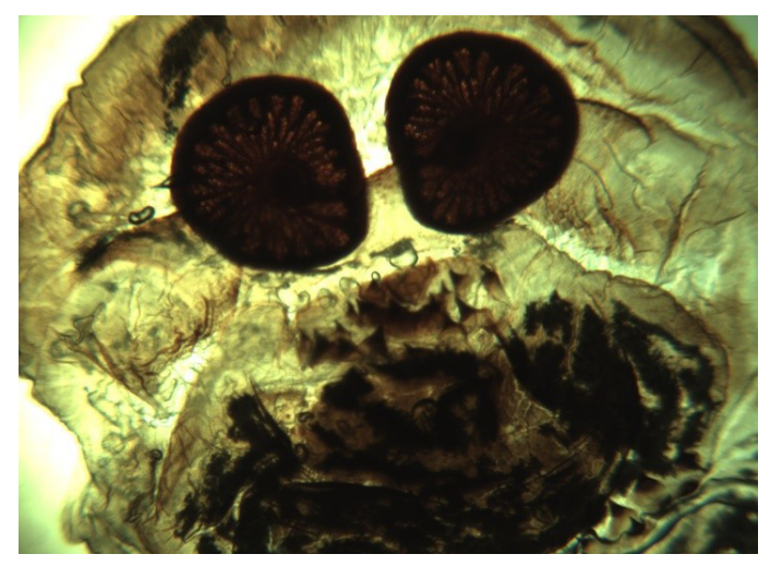
Figure 3: Cross section of rostral part of O. ovis larva (under 4x microscopy)