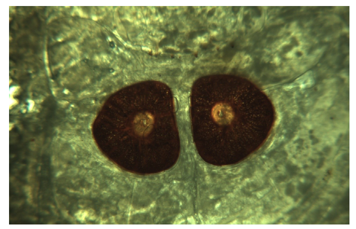
Figure 4: D-shaped closed, dark black coloured, stigmal plates with radially arranged respiratory holes (under 4x microscopy)