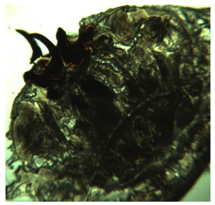
Figure 5: Oral hooks of O. ovis larva (under 4X microscopy)

the larvae yet not migrate and reach the aberrant locations like the cranial cavity. The episodes of abnormal hyper excitability signs in the affected buck were caused possibly due to the injury to the nasal mucosa by the migration of O. ovis larvae, as mechanical activity of oral hooks and spines as well as the proteolytic enzymes present in the secretory and excretory products of these larvae were responsible for these changes (Tabouret et al., 2003). Secondary infections often lead to muco-purulent discharge, respiratory distress and sneezing fits as observed (Urquhart et al., 1996). In the blood serum examination, it's shown that there was increased level of serum magnesium, total protein, glucose, SGPT, creatinine and decreased level of Serum calcium, phosphorus, SGOT, and albumin. However, elevated level of total proteins (80-90 mg/dl) and reduced glucose level (25-30.8 mg/dl) was found previously in the case of nasal bot (Sharma et al., 2014).